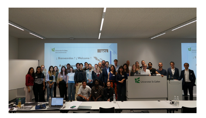
The Community at the Anthropologies of extortion in Latin America.

On September 29, the CLS had the privilege of hosting sixteen international scholars for an academic exchange examining the social life of extortion across the Americas, Asia, Europe, and Africa. This scholarly gathering was part of a five-year European Research Council funded project led by University College London (UCL). This collective journey delved deep into the anthropologies of extortion in Latin America, transcending borders and disciplines. Research papers were focused on various countries, including those in Latin America such as Bolivia, Brazil, Colombia, Ecuador, Guatemala, and Venezuela, as well as other nations like China, Bangladesh, France, Germany, India, Italy, Nigeria, Pakistan, Peru, South Africa, and the United Kingdom (UK).