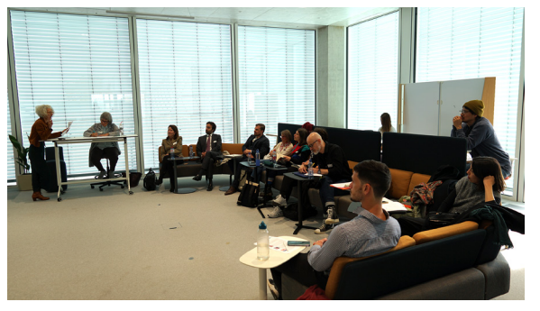
Arte Latinoamericano, SQAURE, HSG.

workshop not only facilitated a profound exchange of ideas, but also served as a catalyst for forging new connections by creating an atmosphere of collaboration and camaraderie.