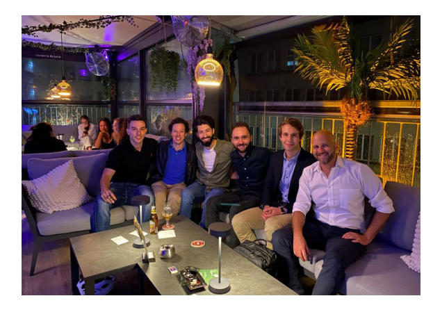
HSG Alumni Club Andean Region get-together in Zurich.

Furthermore, on September 21st, the Swiss chapter of the club reunited for the first time in person. They had a relaxed evening in a Zurich bar, exchanging interesting stories from their experiences and connections to the Andean Region. They are delighted to continue organizing social events, company visits, or discussions in their second year. Currently, they are actively seeking new members to help build this alumni bridge between Switzerland and the Andean Region. Feel free to reach out to them via their LinkedIn group. They look forward to seeing you soon and expanding their networks.