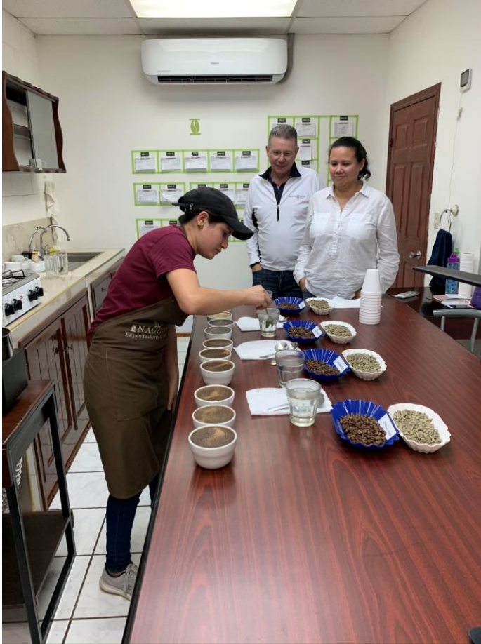
coffee tasting facility