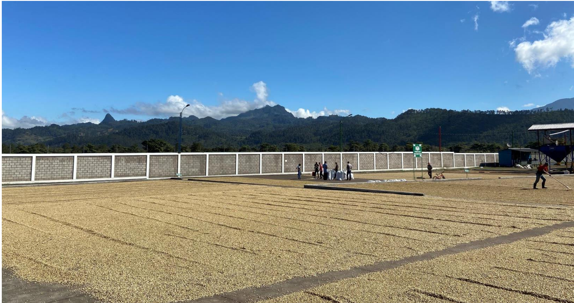
Sun-dried coffee in parchment