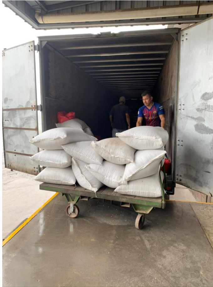
Warehouse INAGINSA – dry mill